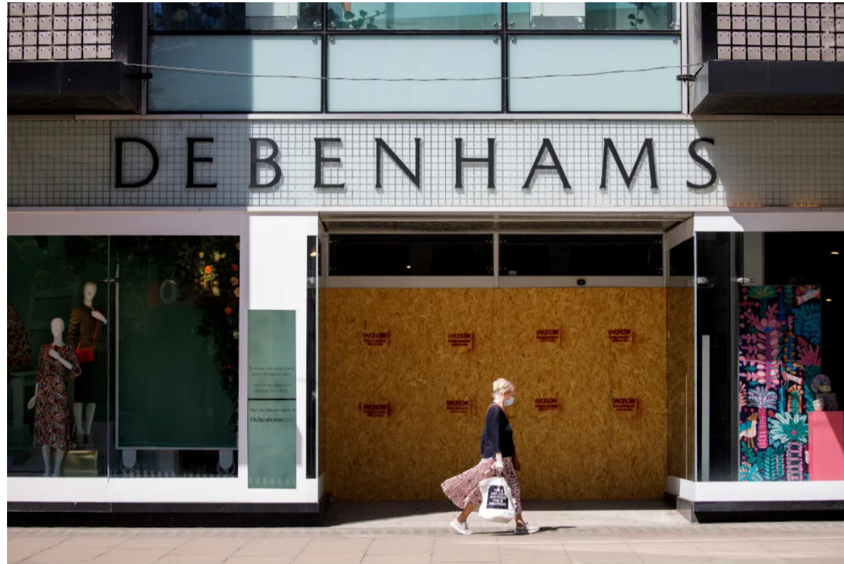
UK department store group Debenhams

The latest shake-ups are only residual tremors in the market earthquake blighting department stores worldwide, affecting some truly long-established distribution giants.