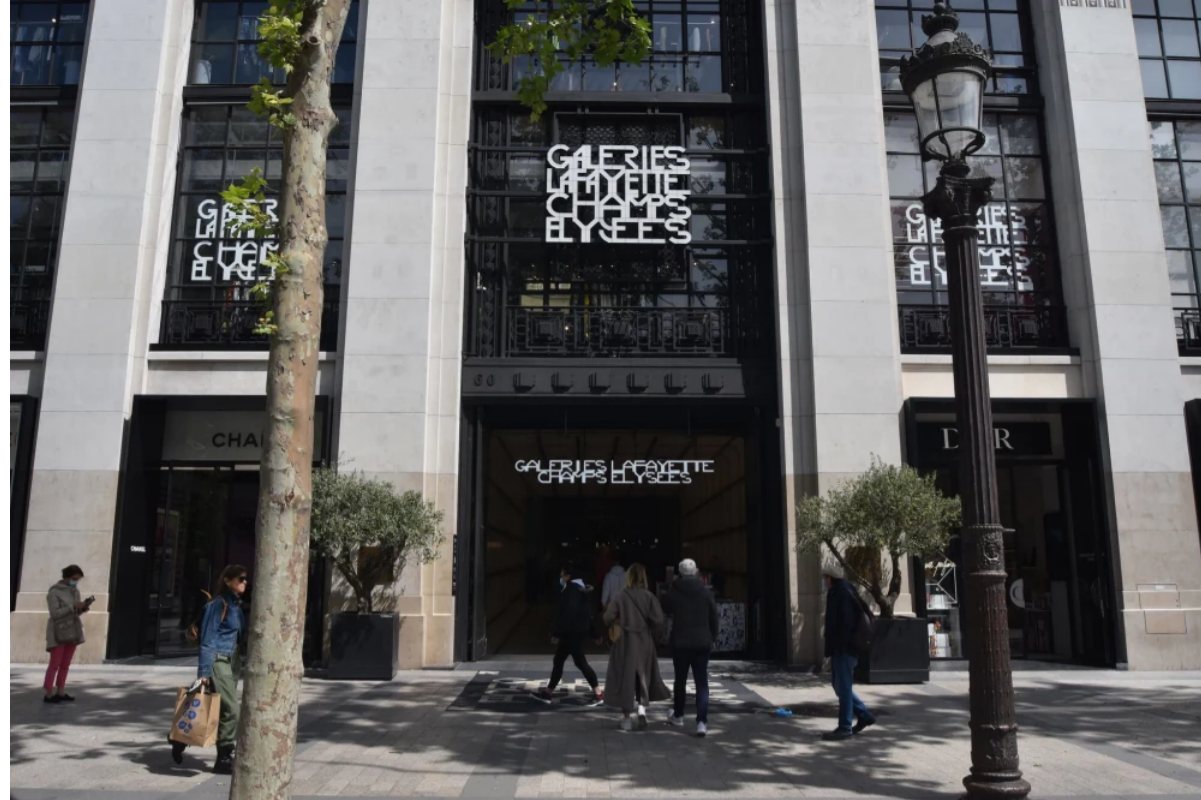
In Paris, the Galeries Lafayette's Champs-Élysées branch has been hit by the absence of tourists.

In cities like Paris and London, the strength of department stores stemmed from the international appeal of their flagships, featuring exceptional products and a shopping experience in lavish buildings. A reputation that benefited all their national and international branches, but which gradually led to a business model in which profitability was dependent on tourists' expenditure in the chains' flagship stores.