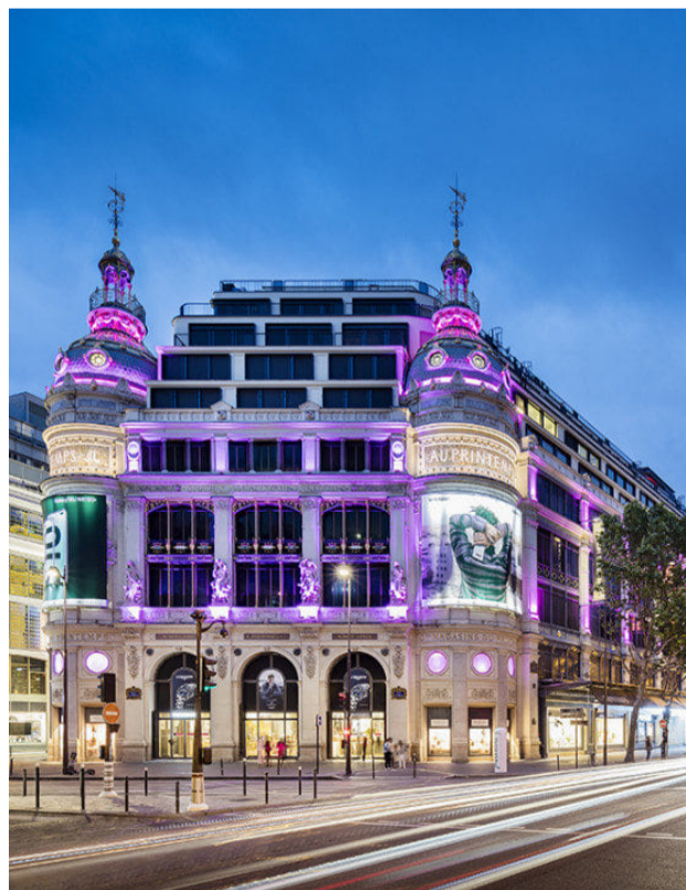
Le Printemps's flagship on boulevard Haussmann, Paris - Printemps