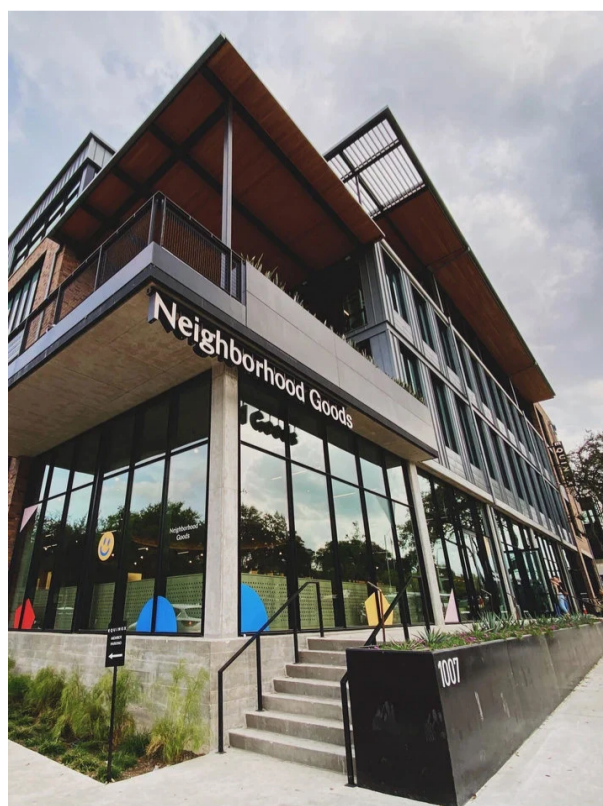
In the USA, Neighborhood Goods exemplifies a new generation of retail.

The notion of a curated product range seems essential. Reliance on a locally relevant range appears to be a driving factor, as do a selection of second-hand items and showcasing brands that are available exclusively on the web. In the US, the Neighborhood Goods concept, introduced in 2018 in Texas and based on a regular rotation of lifestyle, fashion and beauty labels culled from Instagram , seems to be a success.